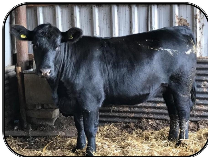
Midgely - Lots 201 to 203